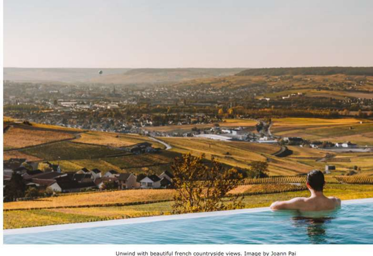
Unwind with beautiful french countryside views.

Royal Champagne Hotel & Spa partners with Parisian Jeweller, Maison Chaumet to unlock exclusive private access to the Maison's brand new 'Joséphine Napoléon, an (extra)ordinary story' exhibition (19th May - July 18th)