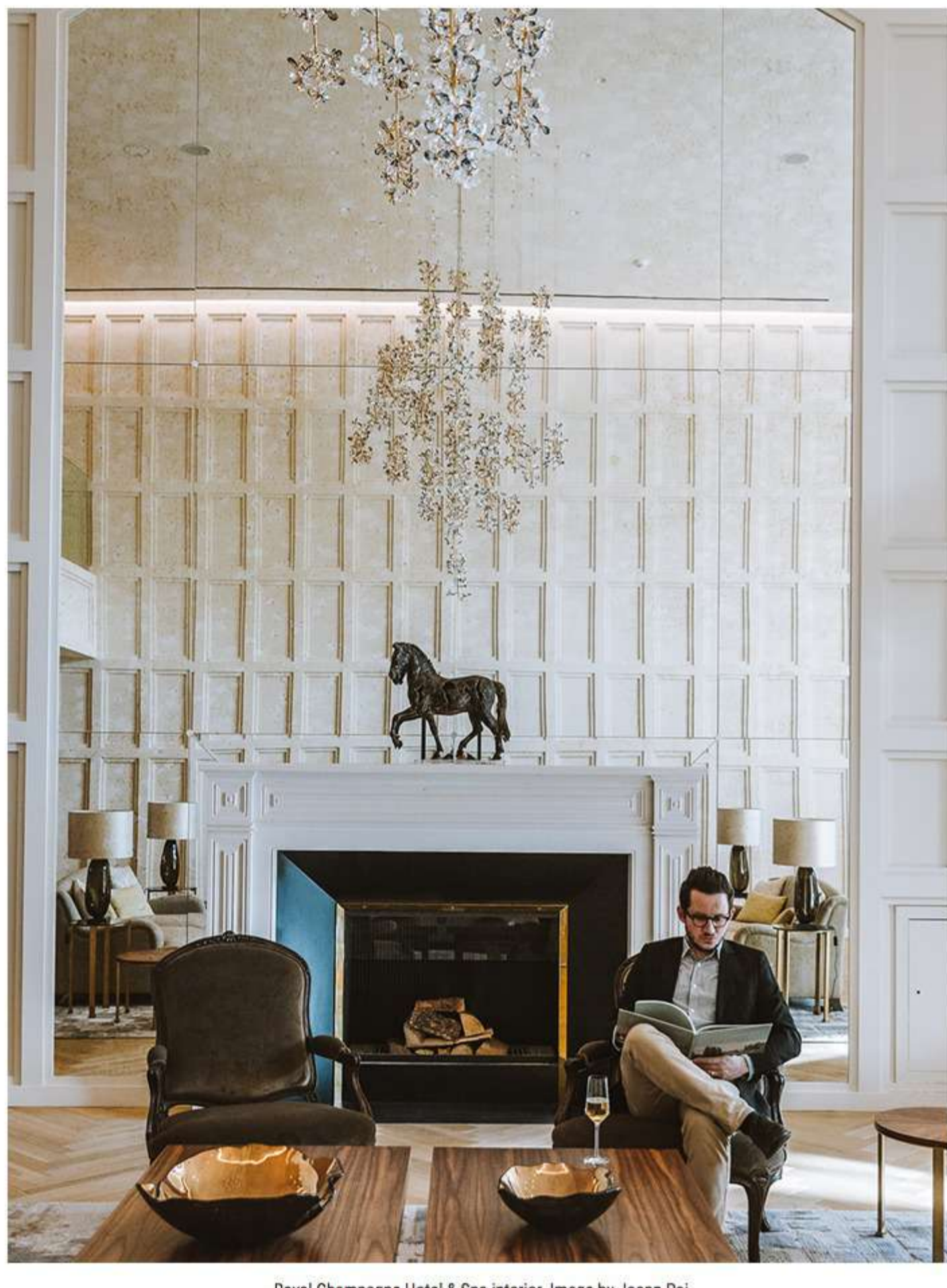
Royal Champagne Hotel & Spa interior.

Royal Champagne Hotel & Spa is rumoured to have been favoured by Napoleon and his entourage when he was Emperor of France, during its original incarnation as a coaching inn, and today, the hotel has even named its most exclusive suite after his regal first wife, the 'Suite Joséphine'.