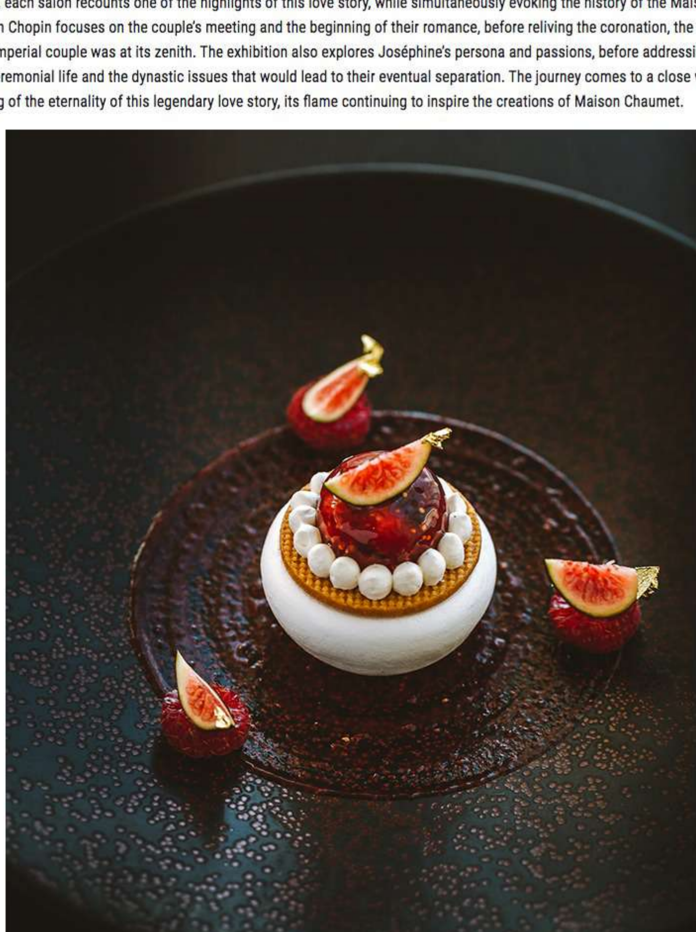
Divine dining at Royal Champagne Hotel & Spa