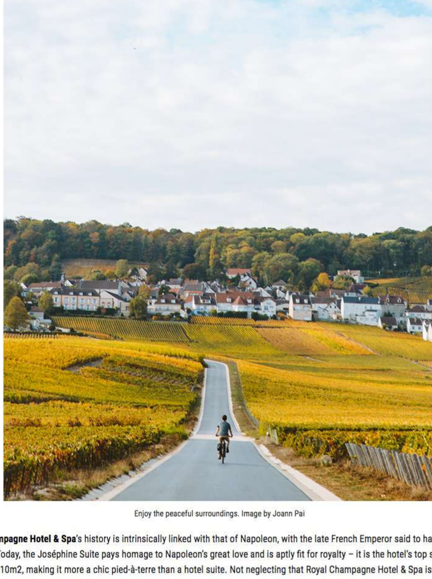
Enjoy the peaceful surroundings.

Royal Champagne Hotel & Spa is delighted to announce its new partnership with revered French jewellery house Maison Chaumet. Between 19 May and 18 July 2021, Royal Champagne will afford hotel guests booking the Joséphine or Marie-Louise Suite a private viewing of Chaumet's new exhibition, Joséphine Napoléon, an (extra)ordinary story, unveiled this month to mark the 200th anniversary of Napoleon's death.