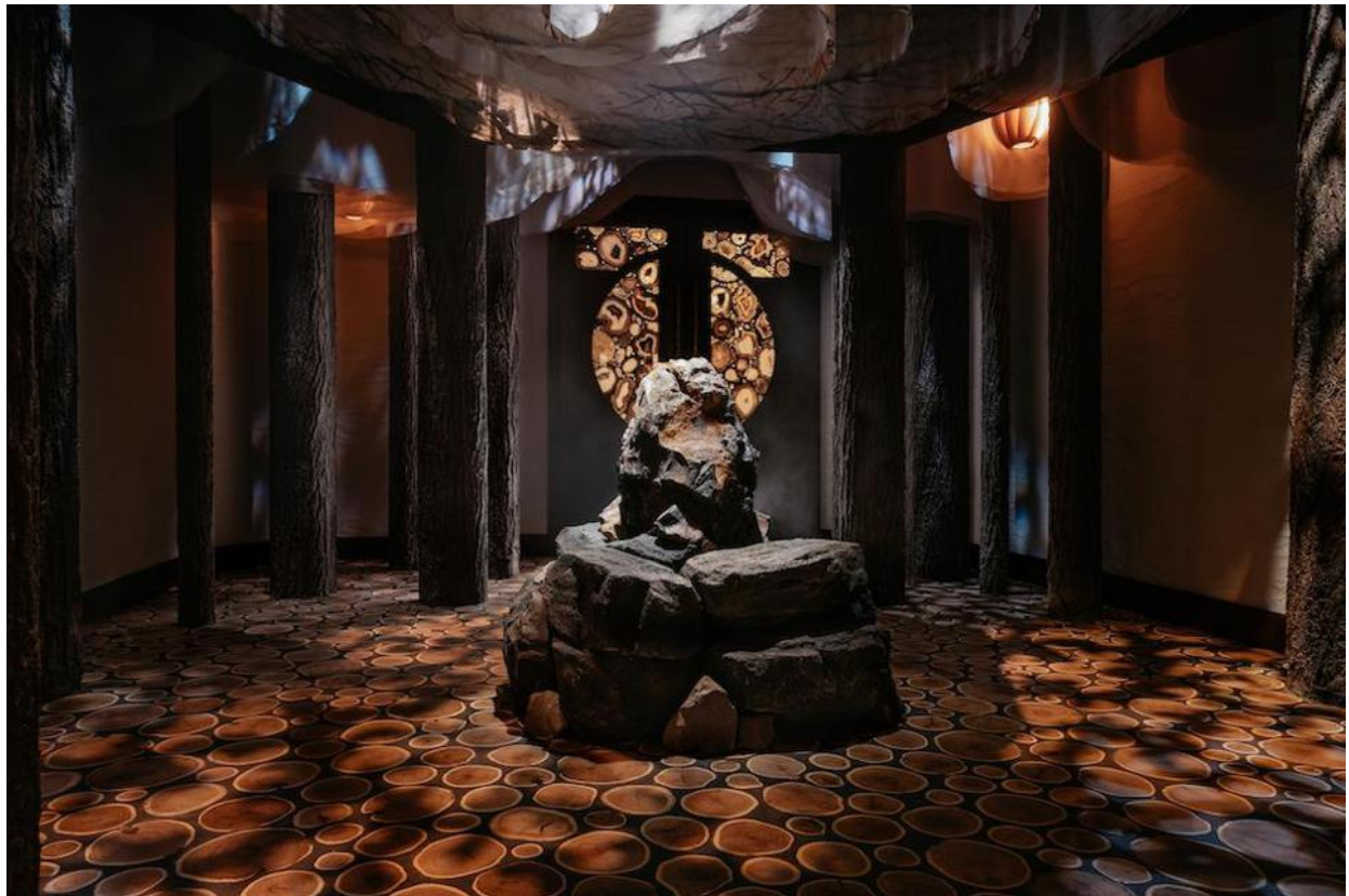
As the center of the spa, the Tenaya stone provides a place to reflect and set intentions. DISNEY'S GRAND CALIFORNIAN HOTEL & SPA

Or swing for the Golf Buddies in Villa offer, which includes a three- to five-bedroom villa with a daily round of golf at the resort. Breakfast is prepared in the villa each morning.