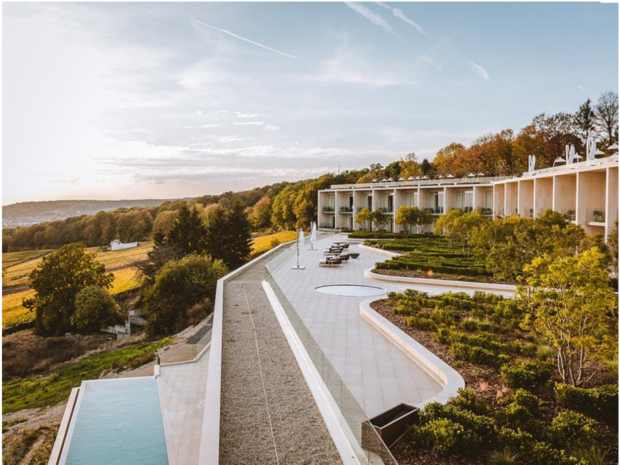
Have a James Bond-worthy stay. ROYAL CHAMPAGNE HOTEL & SPA