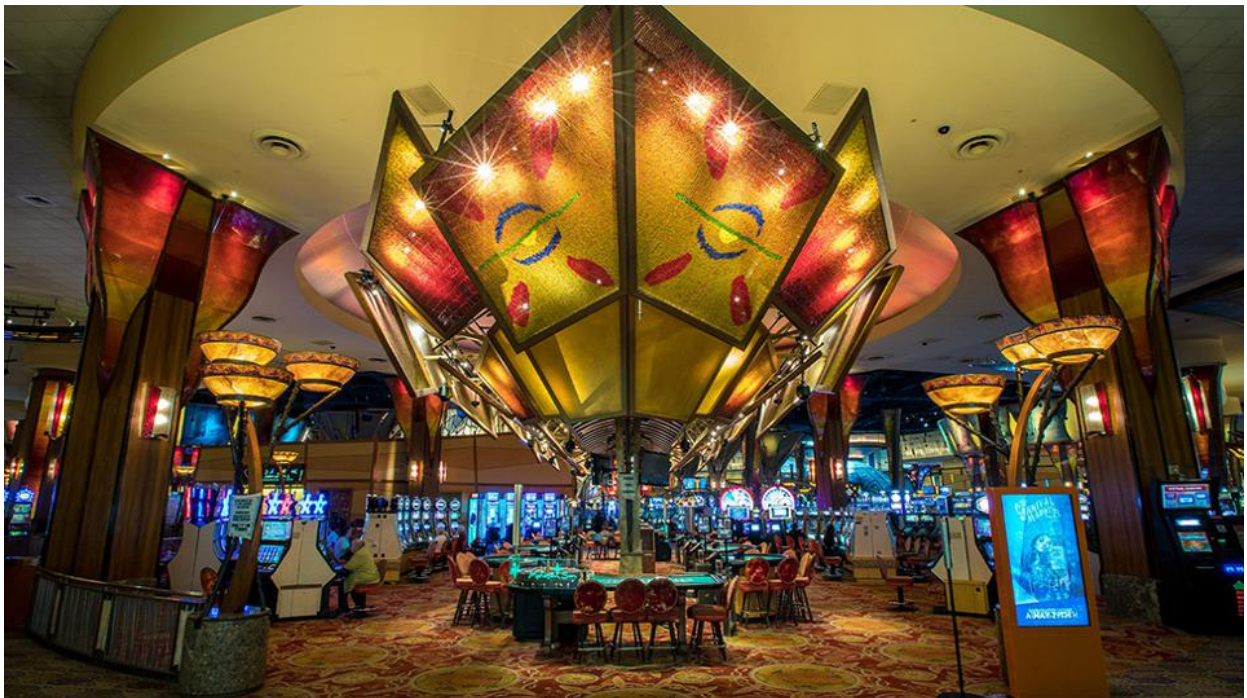
Celebrate Mohegan Sun's 25th anniversary.

After eating and drinking, retire to The American Club , a historic Five-Star hotel on the Kohler campus. Its elegant rooms have bathrooms outfitted with the indulgent Kohler shower experience.