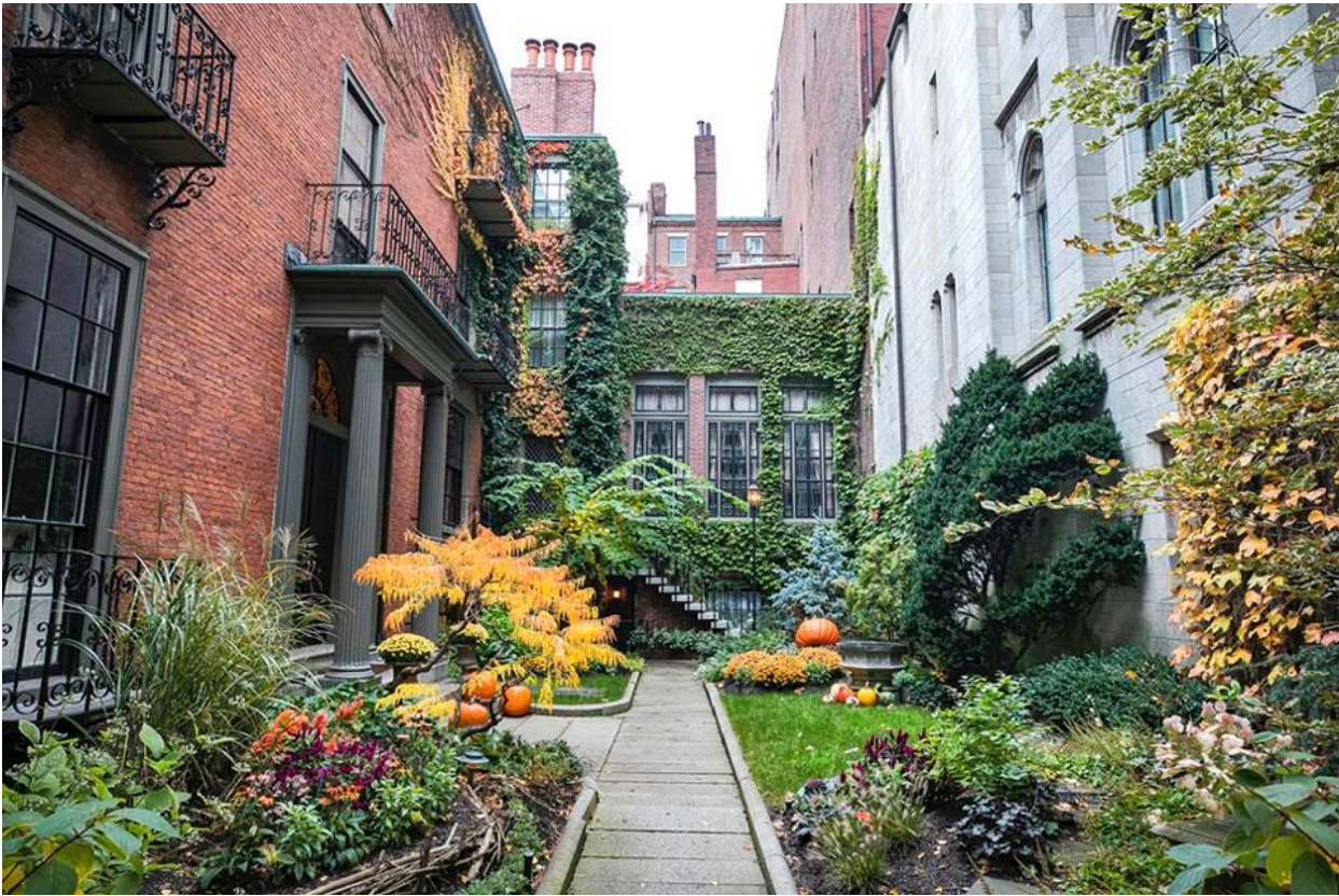
Walk through Beacon Hill. KYLE KLEIN

October usually ushers in pumpkin spice lattes, apple picking, Halloween and turning leaves. It’s also a great time to travel — the cooler weather makes it more comfortable to hit the road and start exploring.