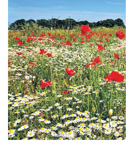
Walks through wildflower fields