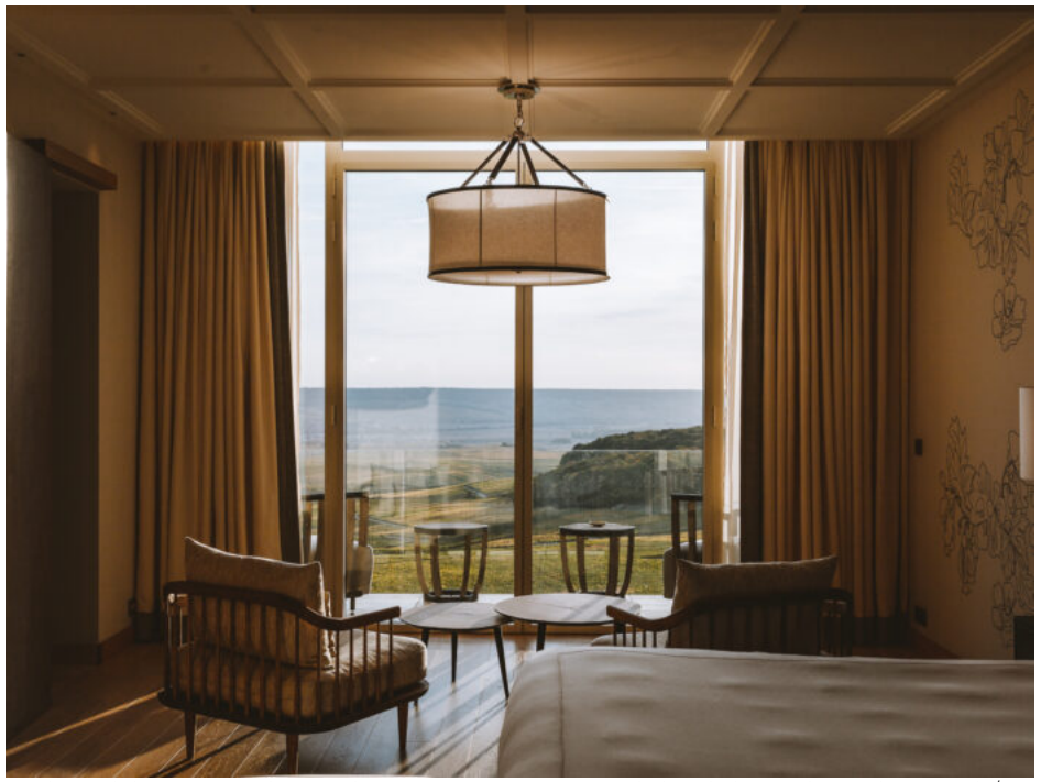
The Royal Champagne's workation packages feature expansive suites overlooking the heart of the French countryside

The Royal Champagne Hotel and Spa has adapted its previous vacation offerings to cater for those hoping to transport their home offices, allowing guests to revitalize their workspace. The Royal Champagne's workation packages feature expansive suites overlooking the heart of the French countryside, use of the extensive fitness suite and room service working lunches, with corporate room hire available at a preferential rate.