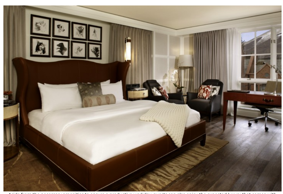
Aside from the necessary amenities to ensure a productive workday, guests can also enjoy the expected luxury that comes with any trip to St. Regis Aspen

Combining the luxury of the St. Regis Aspen's rooms with the necessity of a formal office space, the brand-new 'Alpine Office Annex' package leaves no detail behind. This exclusive package comes complete with a dedicated Zoom stylist to assist with hair, make up and wardrobe, enhanced lighting and a variety of necessary tech to ensure all virtual meetings run smoothly.