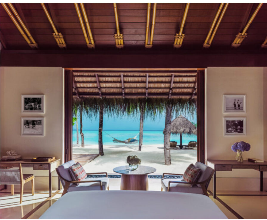
Each villa offers high-speed WiFi and ample space to work

Dreaming of swapping your desk for the beach? With One&Only Reethi Rah's new 'Stay a While Longer' package, you can. Guests partaking in this exclusive package can stay in the ultra-luxe villa-only resort for 28-days or more, allowing them to call The Maldives home for weeks on end.