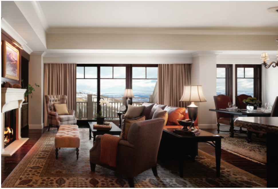
Suites at Montage Deer Valley offer ample room to create a relaxed work environment

For families seeking a much-needed change of scenery look no further than Montage Deer Valley, whose remote location makes for the perfect socially distanced workation destination.