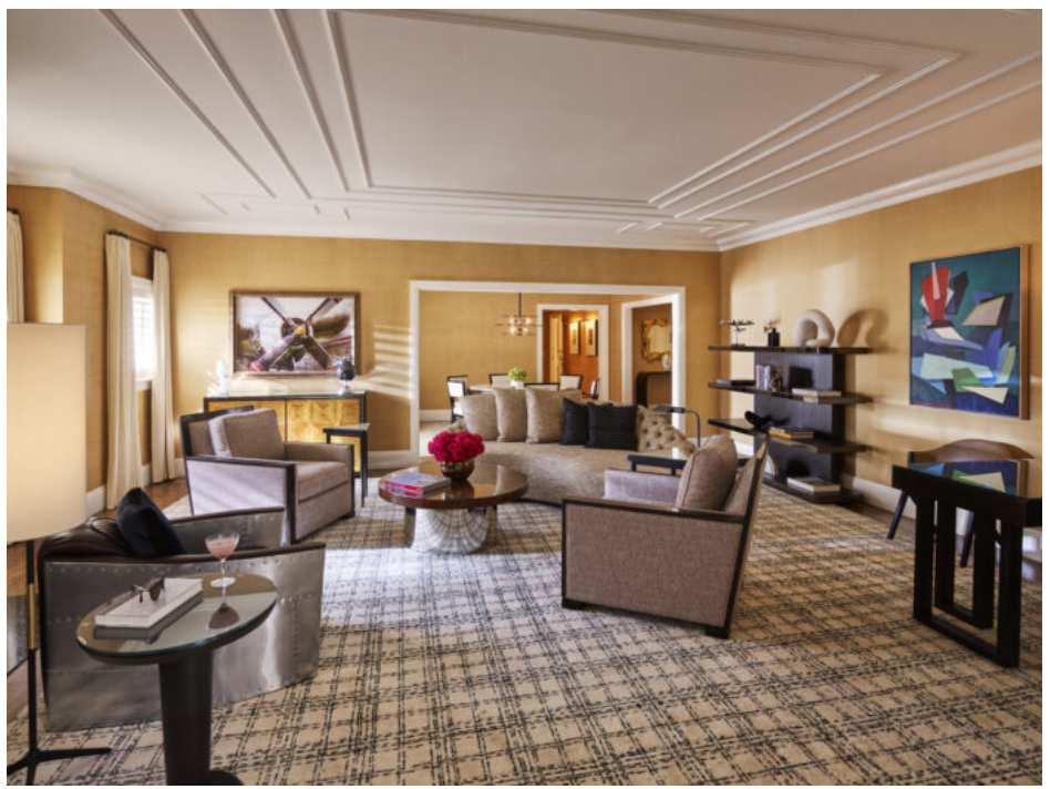
Beverly Hills Hotel is converting its spacious suites into fully-functioning workspaces for the first time ever / ©Beverly Hills Hotel

Catering for those professionals wishing to reinvent their offices, Beverly Hills Hotel is converting its spacious suites into fully-functioning workspaces for the first time ever. The ideal space to host virtual meetings, work with a small team face-to-face, or even just take a break from the distractions faced in a home office, Beverly Hills Hotel is transforming the way we work.