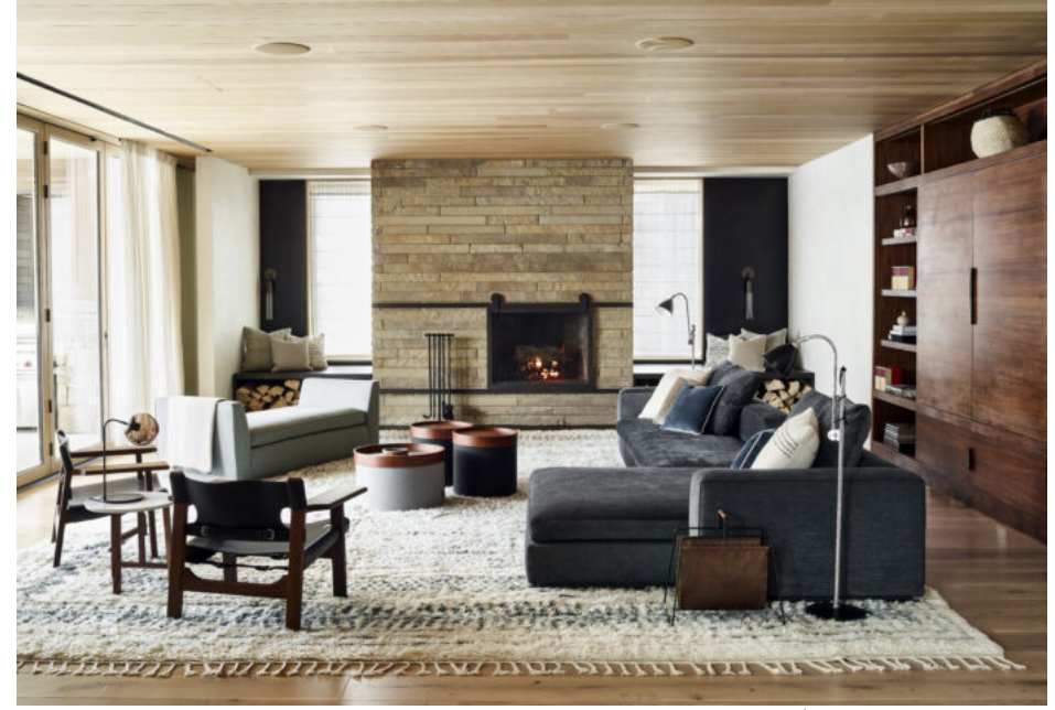
Tasteful and unfussy décor throughout guarantees a tranquil working environment

Offering just eight boutique suites within stunning alpine surroundings, Caldera House provides the epitome of luxury social distancing. Tasteful and unfussy décor throughout guarantees a tranquil working environment, with remote settings ensuring no disruption while you get to business.