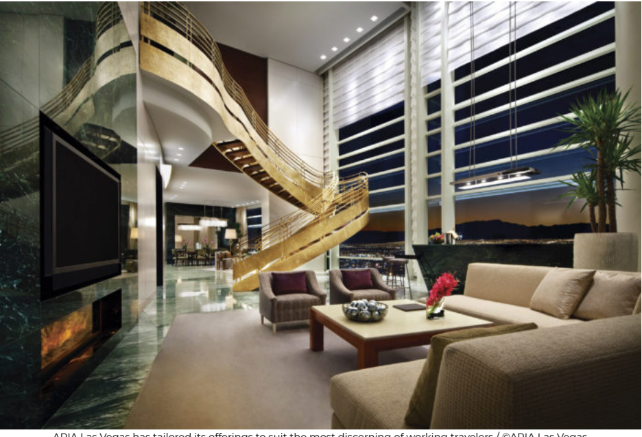
ARIA Las Vegas has tailored its offerings to suit the most discerning of working travelers