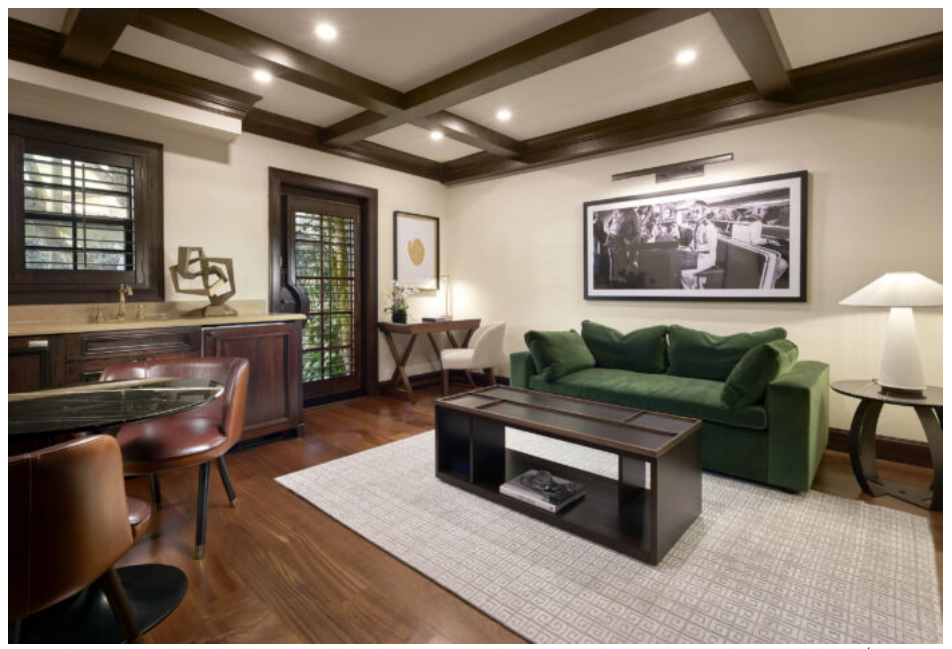
With one, two and three-bed suites available there is room for the entire family to enjoy a Covid-19 friendly break / { t @The}

The Brazilian Court Hotel's new long-stay 'Key to Paradise' package invites guests to make the iconic Palm Beach hotel home for anywhere from one month to six. With one, two and three-bed suites available, all with discreet separate entrances to ensure social distancing, there is room for the entire family to enjoy a Covid-19 friendly break.