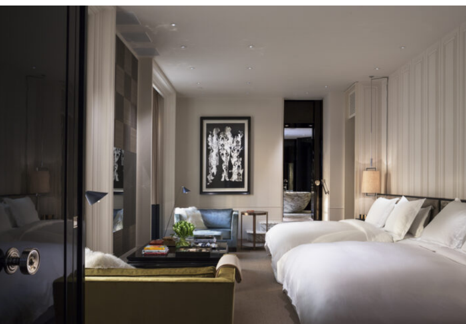
The Grand Manor House is the only suite in the world to have its own postcode / @Rosewood London

For guests seeking seclusion and isolation within the heart of one of the world's business capitals, look no further than the Rosewood London's selection of private suites. Included in the Rosewood's luxury workation offering is the expansive Manor House Suite, where alongside a stunning bedroom and living space, guests can enjoy their own personal library, and private entrance, preventing the need for any interaction with other guests.