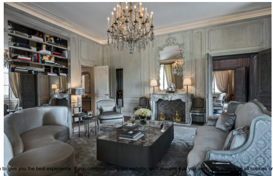
We use them to g