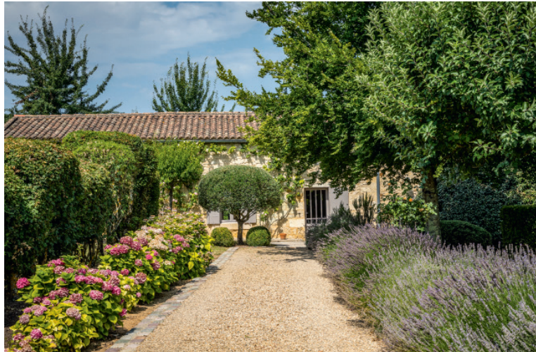
One of St-Emilion's top estates, Troplong Mondot has a rarefied status that is reflected in a property housing just three rooms