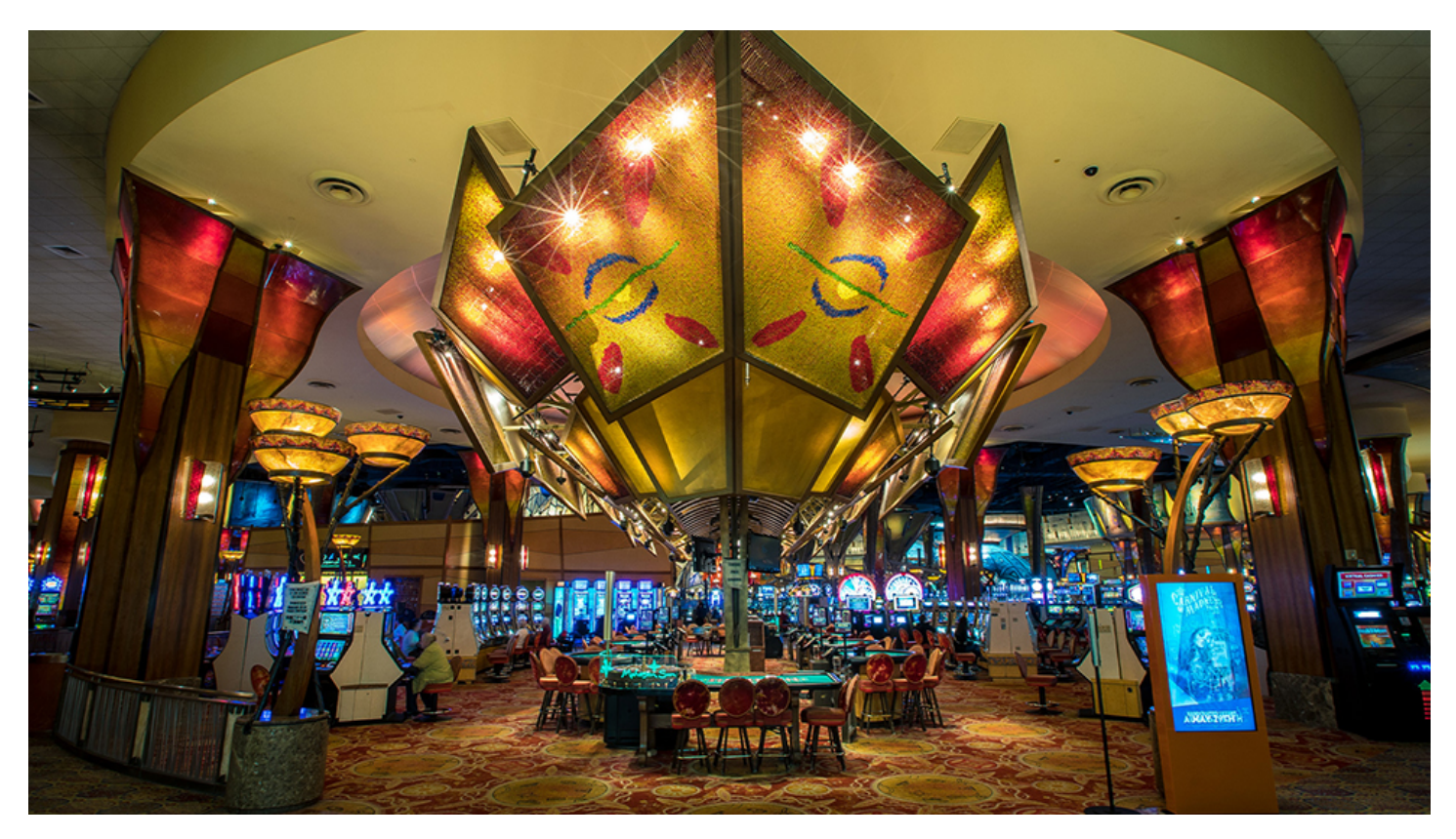
Celebrate Mohegan Sun's 25th anniversary.

Uncasville, Connecticut (https://www.forbestravelguide.com/destinations/mystic-connecticut/travel-guide)