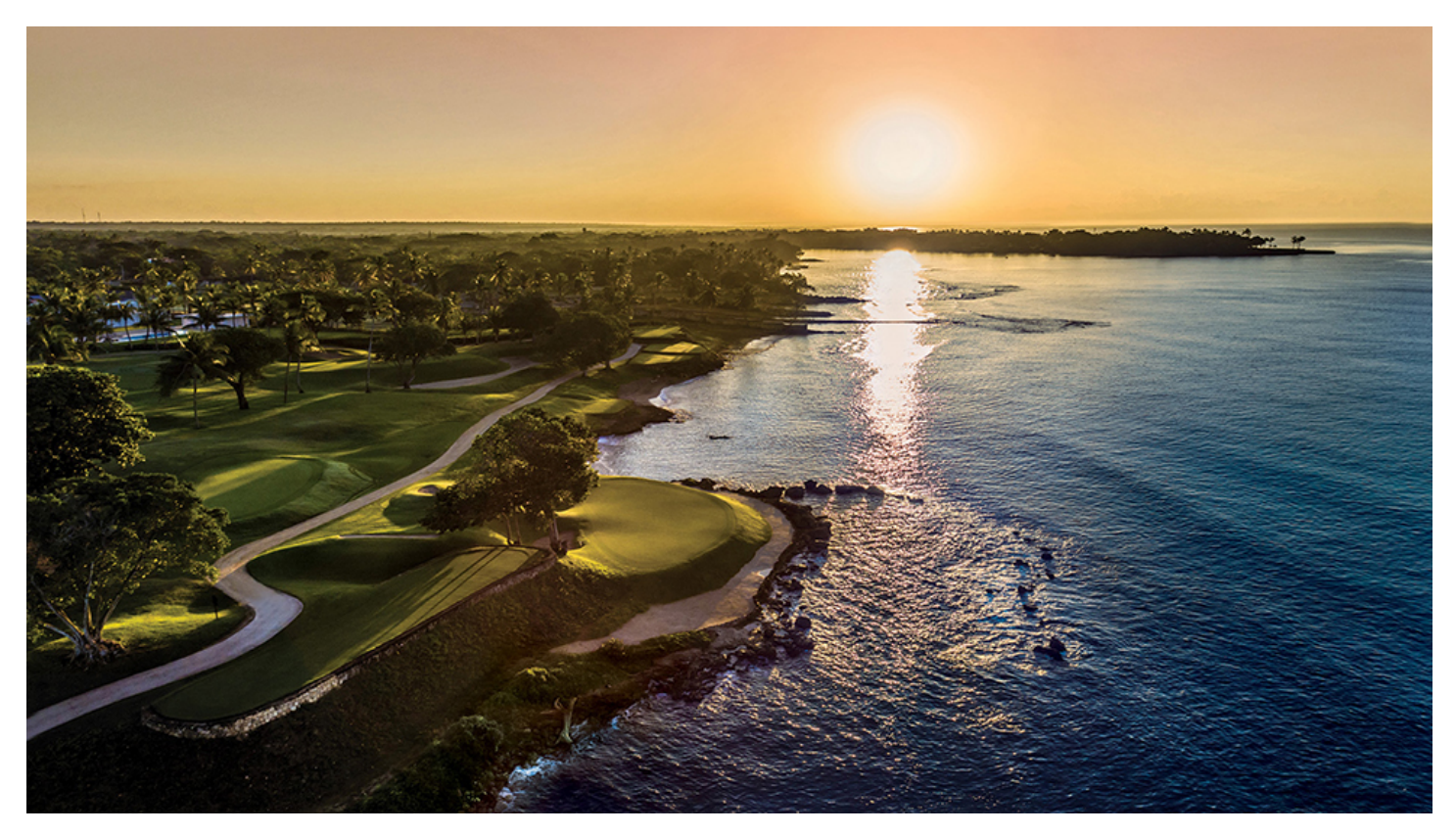
Play a round at Casa de Campo.

Dominican Republic (https://www.forbestravelguide.com/destinations/dominican-republic-dominican-republic/travel-guide)