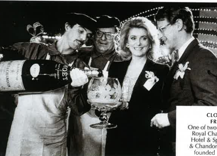
CLOCKWISE FROM TOP One of two pools at Royal Champagne Hotel & Spa; Moët & Chandon House, founded in 1743; actress Catherine Deneuve gets into the Champagne spirit.

“MISTY, VINE-LINED HILLS SET A PICTURE-PERFECT BACKDROP TO HISTORIC MANORS, RUSTIC COTTAGES AND A QUALITY OF FRESH AIR THAT GOES STRAIGHT TO THE HEAD”