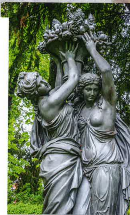
CLOCKWISE TOP LEFT Actress Dany Robin at Moët & Chandon in 1955; the rooms at Royal Champagne Hotel & Spa; cast-iron statues in Town Hall Garden, Épernay; the historic Moët & Chandon House; and underground in the Moët champagne cellars.

O n the bubble trail in Champagne, in north-eastern France, we're looking for effervescence and a balance of richness, elegance and crispness – all qualities the region has in spades. The birthplace of good fizz is a natural beauty with and without the wine goggles worn so elegantly in these parts. Misty, vine-lined hills offset historic manors, rustic cottages and a quality of fresh air that goes straight to the head. The local climate is chilled and often drizzly – all the better for grape production and huddling around fires. “In Champagne, the sunshine is in the bottle,” says Moët & Chandon chef de cave – or head winemaker – Benoît Gouez (also our driver, the pharmacist and hotel receptionist). But when the sun breaks through, Champagne sparkles. Meanwhile, as corks pop and golden liquid cascades into Riedel crystal, the tastings begin. It's Moët Impérial's 150th anniversary this year, so the pouring starts with this good-time drop. “You'll experience bright fruitiness, a seductive palate and elegant maturity,” says Gouez as he swirls, sniffs, sips and spits. At Moët, he says, the challenge is consistently hitting that mark year after year despite the ever-changing >